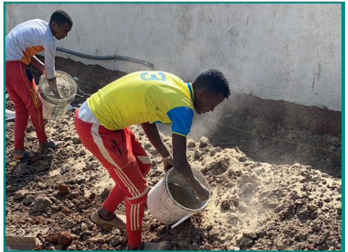
Miyawaki Plantation Initiative at Ethiopia Unit