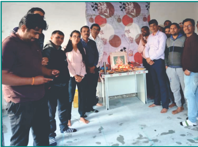
Ganesh Utsav at Ethiopia Unit

We are committed to create a diverse and inclusive workforce that includes a range of ages, ethnicities, religions and worldviews. We are focused on building a collaborative environment where the employees are valued and appreciated. We believe that the growth of our employees is imperative to the growth of our organisation.