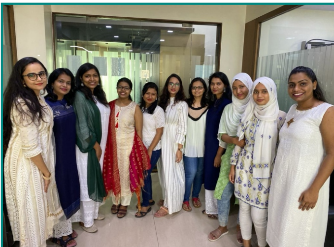
Independence Day Celebration at Head Office