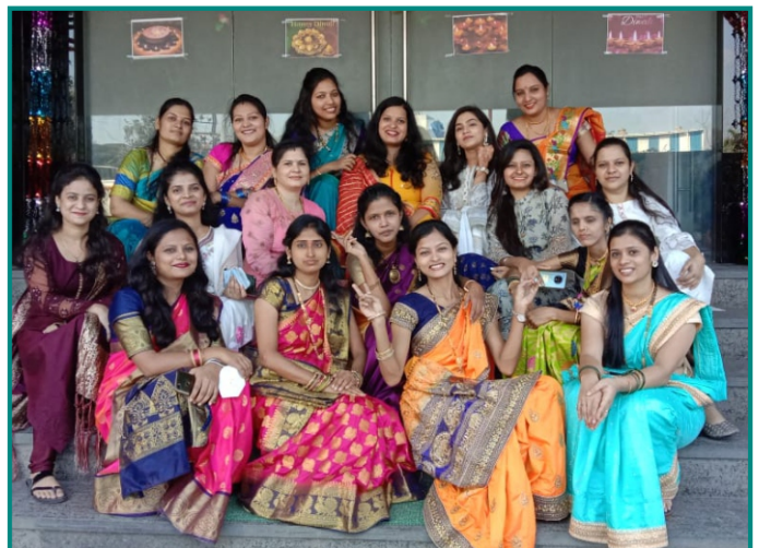
Diwali Celebration at Navi Mumbai Unit